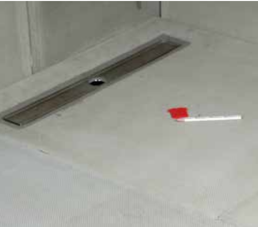
10 Showerlay-Linear are 40mm thick. The rest of the floor can be raised to this height using Multiboard 40mm.