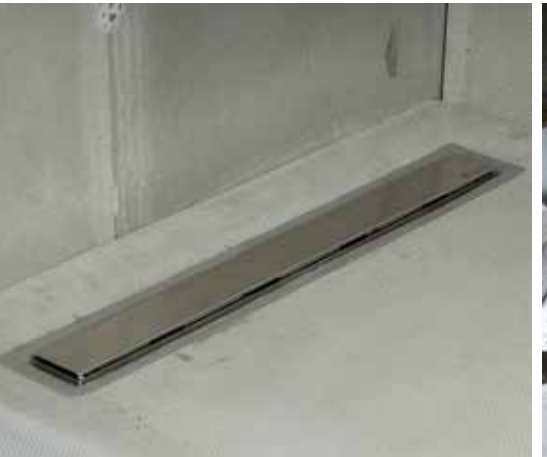
C Ensure that this is flat, secure and will support the entire Showerlay.