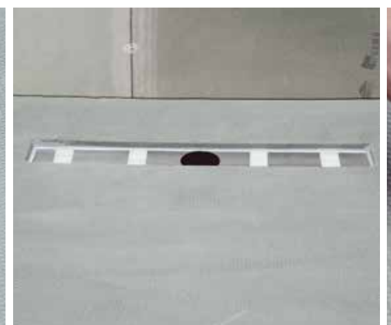
7 Stick the four 4mm self-adhesive pads to the metal base of the Showerlay.