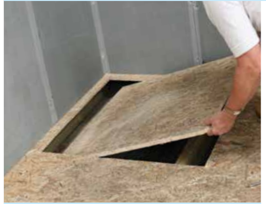
A Decide where the Showerlay is to go, draw around it and cut the floor section out using a jigsaw.