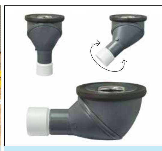
3 Twist the drain to adjust the angle of the exit pipe if necessary to achieve the most suitable gradient.