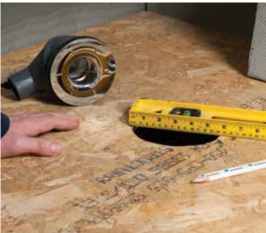
2 Draw a larger circle around the hole with a diameter of between 130mm to 150mm and cut this out using a saw.