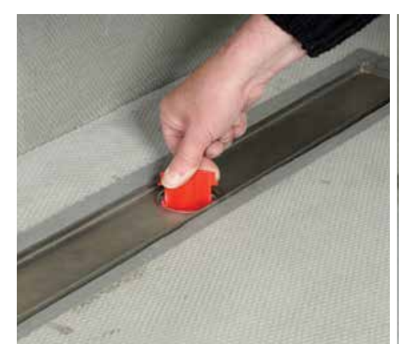
9 Screw the flange ring through the Showerlay into the drain below. Hand-tighten using the red "key". No sealants should be used.