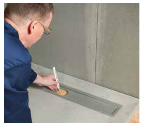
1 Decide where the Showerlay is to go, then mark out the position of the drain hole.