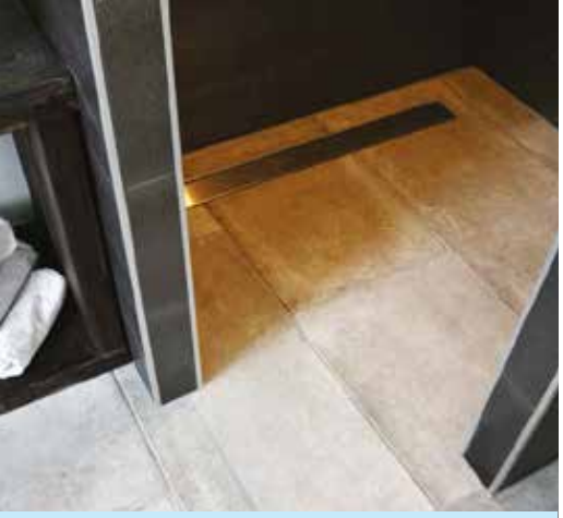
D Install the Showerlay as detailed above, which will result in the Showerlay being level with the floor.