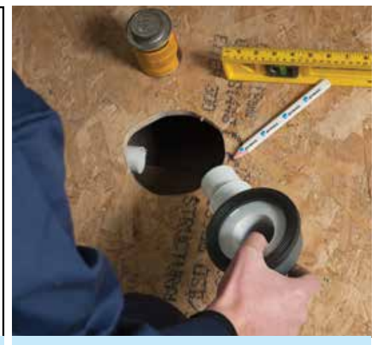
4 Solvent weld the drain to the BS40mm pipe so it is positioned centrally in the hole.