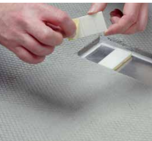
8 If the height needs to be increased further, additional 2mm thick spacers can be stuck on top of the other spacers