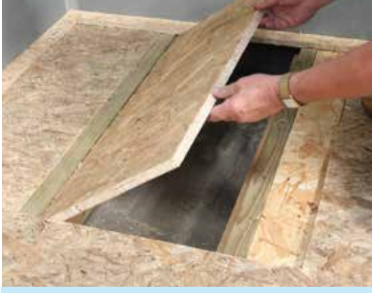
B Make support shelves with the cut up flooring and battens fixed to the side of the joists.