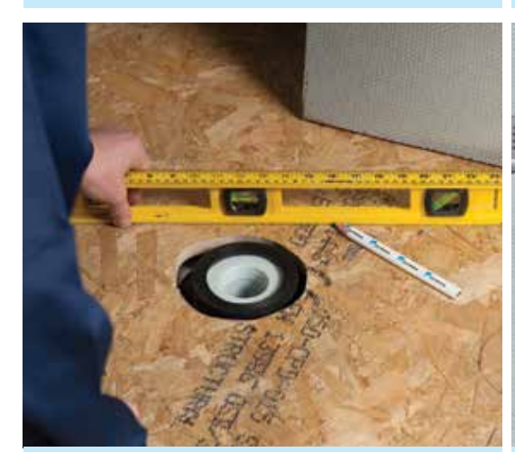
5 Ensure that the floor is level and clean. Using a cement-based flexible tile adhesive, stick the Showerlay to the floor and position the drain tray into position.